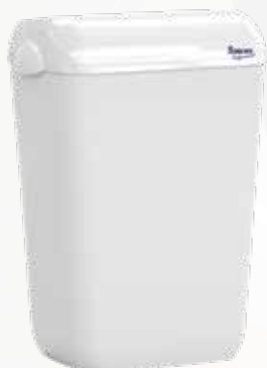
BIN COD. QS.011

Harmonious lines make it possible to offer a bin with a lid opening on the back which once again guarantees the NO-TOUCH concept to the user, visual order and the perception of cleanliness of the environment.